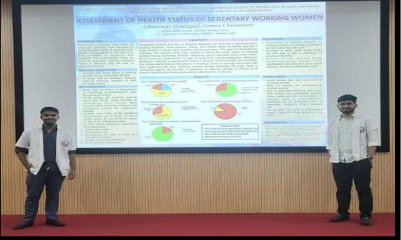
M.Sai Vishal, C. Phanindra, – III<sup>rd</sup> MBBS students presented a e-poster presentation on "Assessment of health status of sedentary working women"

Vinay - III<sup>rd</sup> MBBS student presented a e-poster presentation on "Hatha yoga – Healing tool to relieve anxiety".