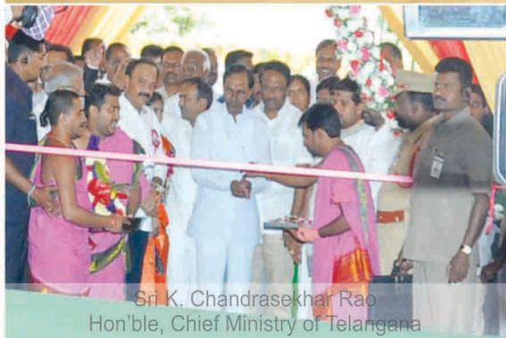
Shri K. Chandrasekhar Rao Hon'ble, Chief Minister of Telangana