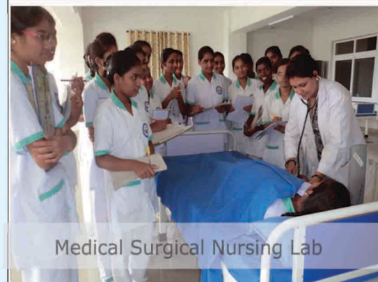
Medical Surgical Nursing Lab